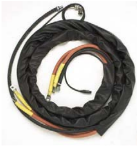
Power, Air and Control Cables