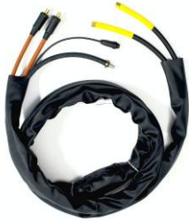
Power, Air and Control Cables