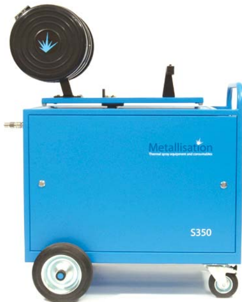
Energiser (S250 or S350) and MIG dispenser

The choice of energiser (S250 or S350) will be dependent upon the requirements of the application. Typically, smaller engineering works will require an S250, 250A energiser. However, some engineering materials can be suitably sprayed at 300A and above, making the S350, 350A energiser a viable alternative with throughput and productivity benefits.