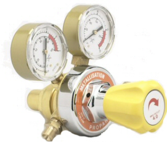
Part number: 21237 Propane regulator