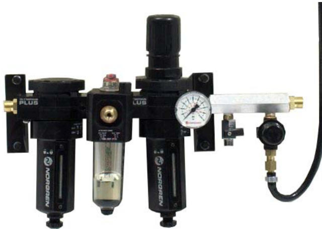
Part number: 21222A Air regulation and filtration unit (ARF)