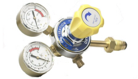
Part number: 21236 Oxygen regulator