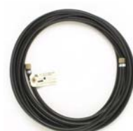
Part number 21504 Motor air hose – 6m