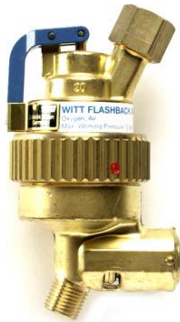
Part number: 21123 Flame arrestor, oxygen