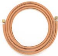
Part number 21501 Propane hose – 6m