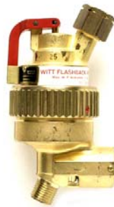
Part number: 21122A Flame arrestor, propane/acetylene