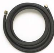
Part number 21503 Nozzle air hose – 6m