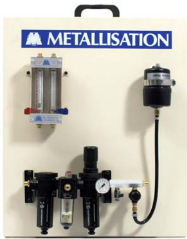
Part number 26900 Flamespray mounting panel (Shown with all standard ancillaries)