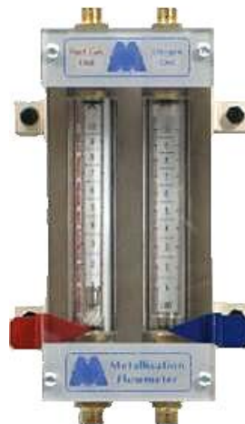
Part number 21129 Flowmeter for wire systems