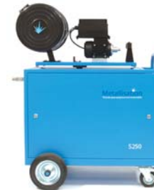
Energiser and push/pull drive unit (mounted on energiser, wall, floor or trolley)

Most commonly used for extended engineering applications or small scale anti-corrosion applications where high spray rates are not needed.