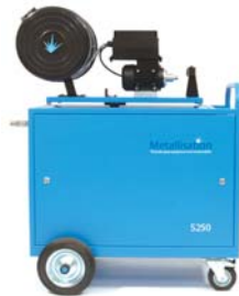
Energiser and pull drive unit

Most commonly used in engineering workshops where a compact footprint is useful and a 5m supplies package length is sufficient. Pull only is suitable for most applications but for heavy usage, a 5m push/pull setup is recommended.