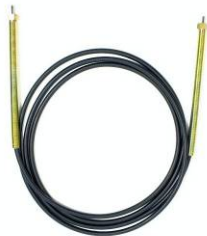
Flexible Drive Cable