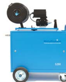
Energiser and push/pull drive unit (mounted on energiser, wall, floor or trolley)

5m, 10m or 20m supplies from wire drive to pistol